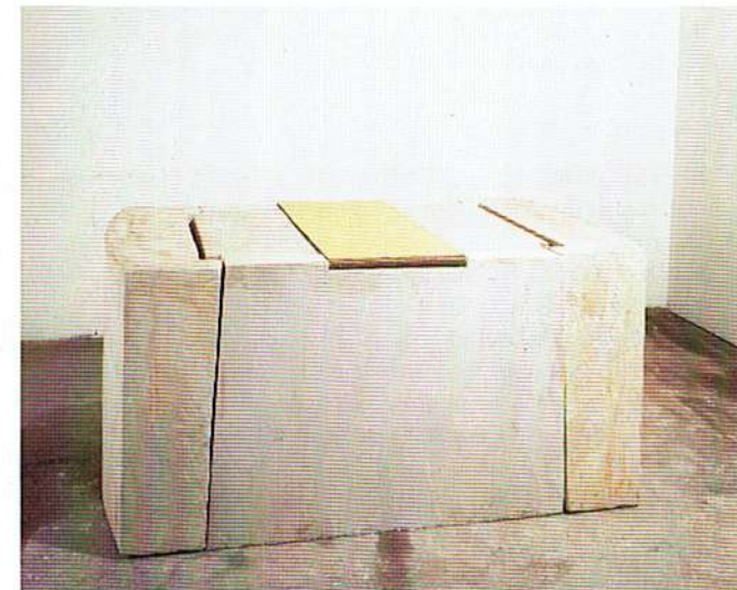
Rachel Whiteread Yellow Leaf 1989

Enquiries: South Bank Centre Publications, Royal Festival Hall, London SE1 8XX. Tel 071 921 0892