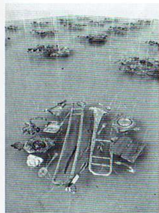
Cornelia Parker Thirty Pieces of Silver 1988