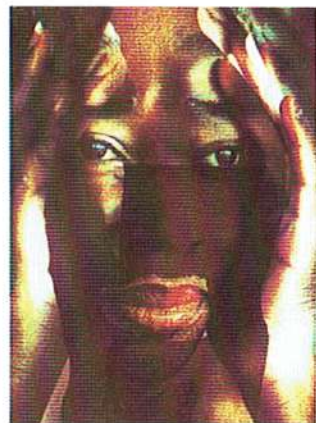
Sonia Boyce Colour Photocopy 1989

The British Art Show 1990 is an opportunity to survey and to participate in the debates animating art as it is made now.